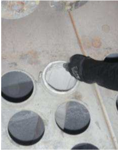
Pict. 7 - Check that the snap-ring is in the correct position against the perforated plate by placing your hand inside the bag