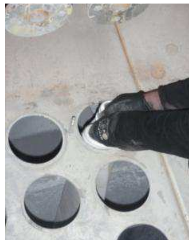
Pict. 6 - Take the top of the bag between your two thumbs and position it correctly on the decking