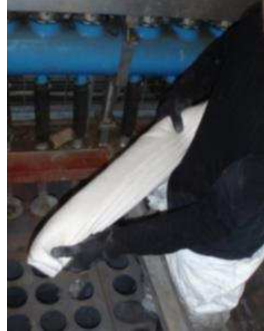
Pict. 2 - Remove the bag from its protective bag and fold it slightly to make it easier to insert it