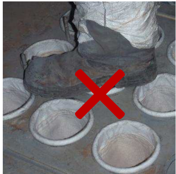
Do not walk on the top of the bags which have just been installed.