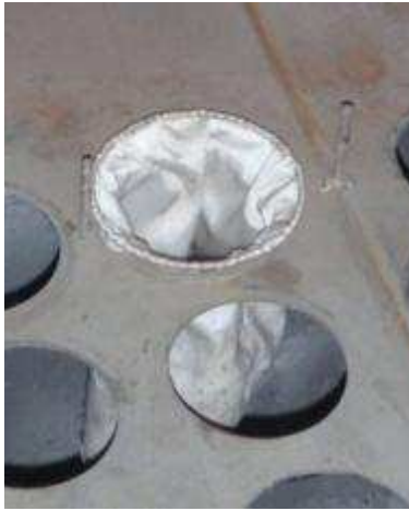
Pict. 1 – Insert installation sleeve through the tube sheet hole