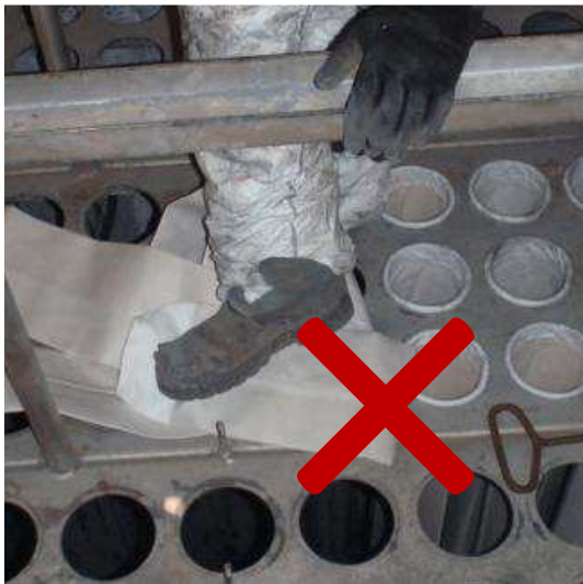
Do not walk on a new bag.