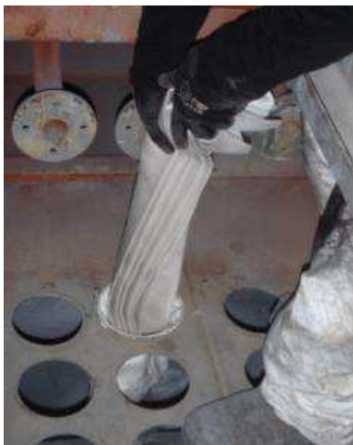
Pict. 3 - Insert the new bag gently inside the protective sleeve