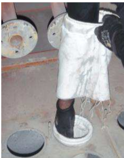
Pict. 5 - Slide the protective sleeve over your right forearm using your left hand