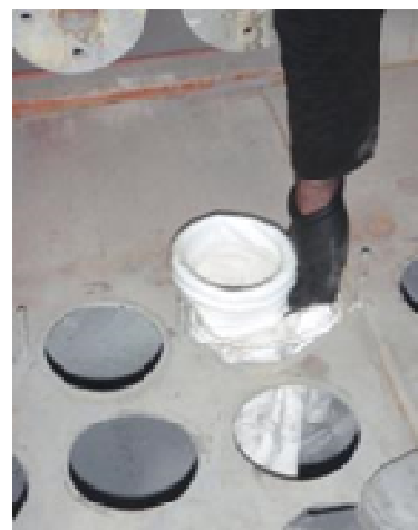
Pict. 4 - Take up the protective sleeve with your left hand