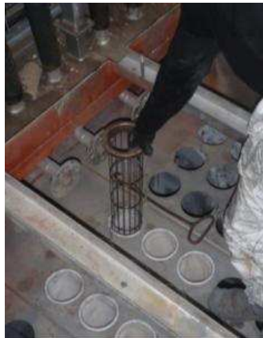
Pict. 9 - Hold the cage until it reaches its final position

Once all the bags have been installed, verify that: