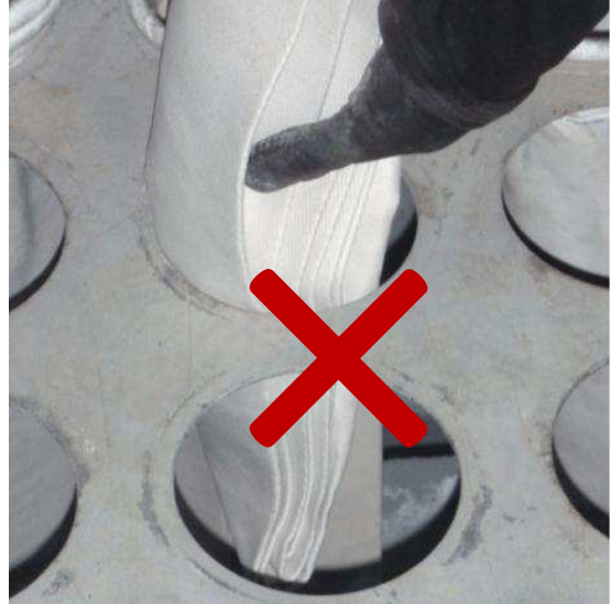
Do not insert the new bag in the perforated plate without using the protective sleeve.