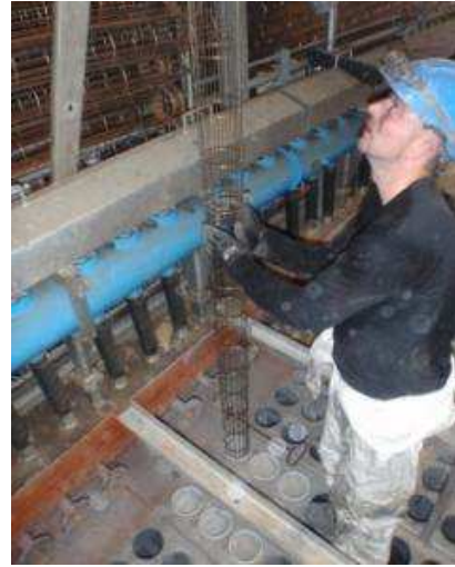
Pict. 8 - Insert the filter cage gently on the axis of the bag by using the gloves to slow down the descent